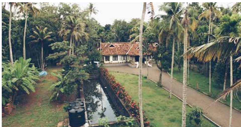
Sreekrishna Ayurveda Chikitsa Kendram Kerala, South-India