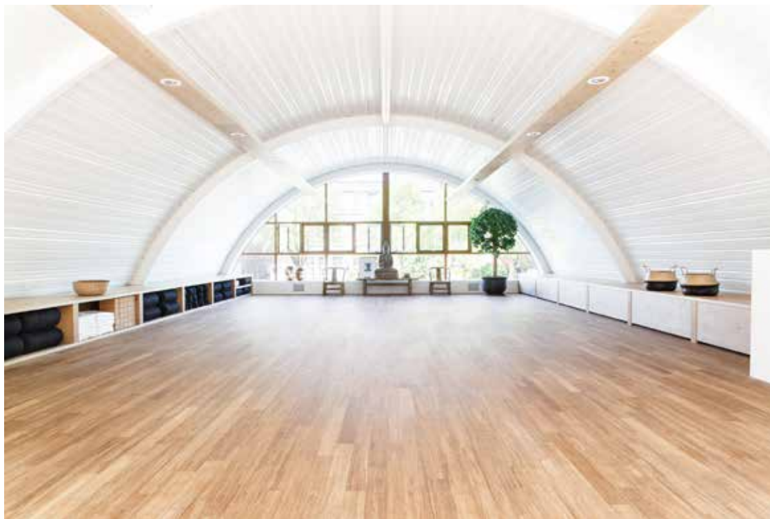
Delight Academy studio Prinseneiland, Amsterdam

Delight Academy is located at the Delight Yoga studio on Prinseneiland Amsterdam. This studio has been created to offer a silent space to reconnect with your true self and cultivate awareness. The upstairs classroom has a dome-shaped roof and large windows offering a beautiful view of the canals and the small harbour and bridge. Downstairs you will find the reception, a tea room and the dressing rooms. The vast majority of lessons will be given at this location. Some courses of the APT will be given at external locations, like the Babaji Ashram ( www.babaji.nl ), located in the beautiful countryside in Loenen which offers additional accommodation and board facilities. The Internship in Year IV of the study program will take place at Sreekrishna Ayurveda Chikitsa Kendram in Kerala, South-India ( www.ayurvedapancakarma.com ). This is a dedicated ayurvedic clinic owned by Ayurvedic physicians Vijith and Vidya (both BAMS), who are both also part of the Delight Academy faculty.